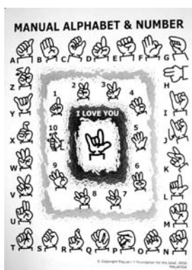
A4 Poster "Manual Alphabet & Number" RM 3.00 per piece RM 10.00 for 4 pieces