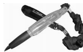
Pen "Sign of I LOVE YOU" RM 10.00 for 2 pens