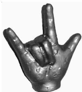
Badge "Sign of I LOVE YOU" Made in wood by Deaf Filipino Size: 32mm X 38mm RM 5.00 per badge