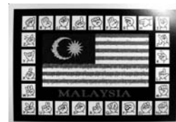
Postcard "Signs of A-Z" RM 1.00 per piece